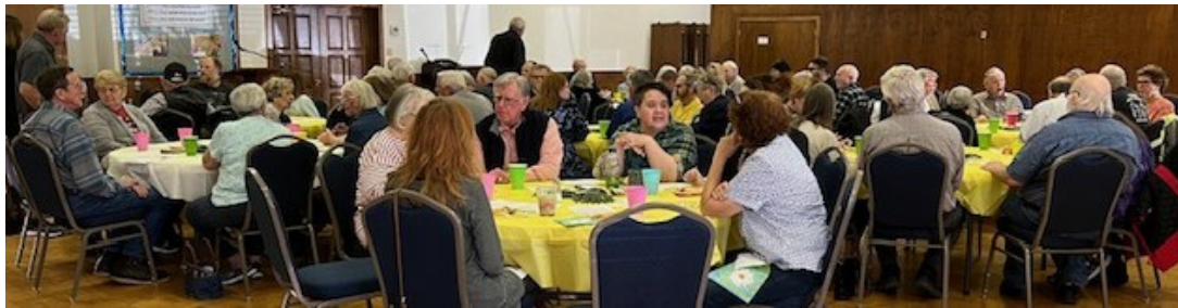
Monday Thursday Service, March 28th at 5:30pm!