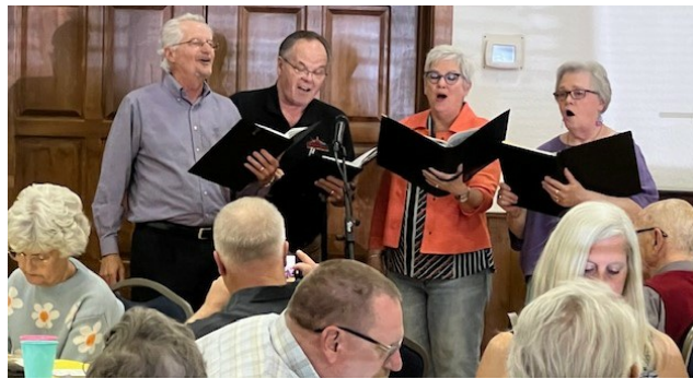
Holy Week Luncheon, Thursday, March 28th in the Fellowship Hall!