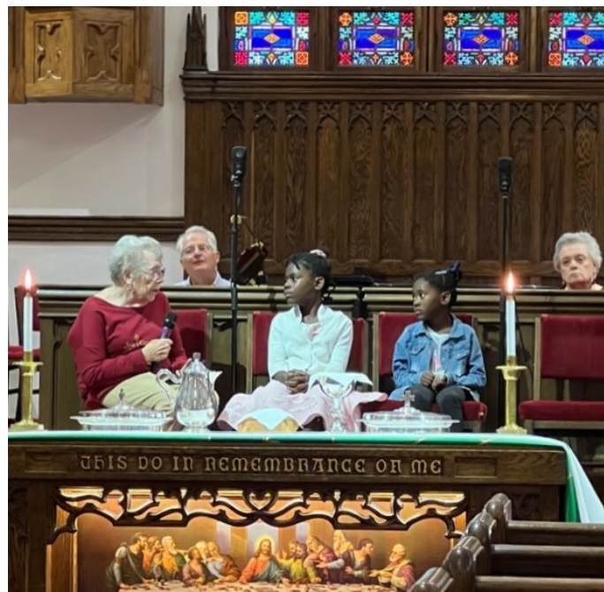
The "Hanging of the Greens on Sunday, November 27th!